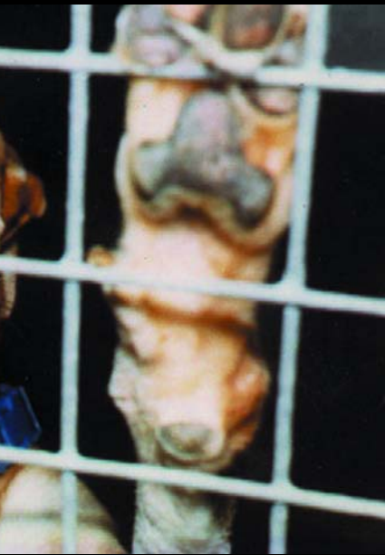
GREYHOUND RESCUE WALES